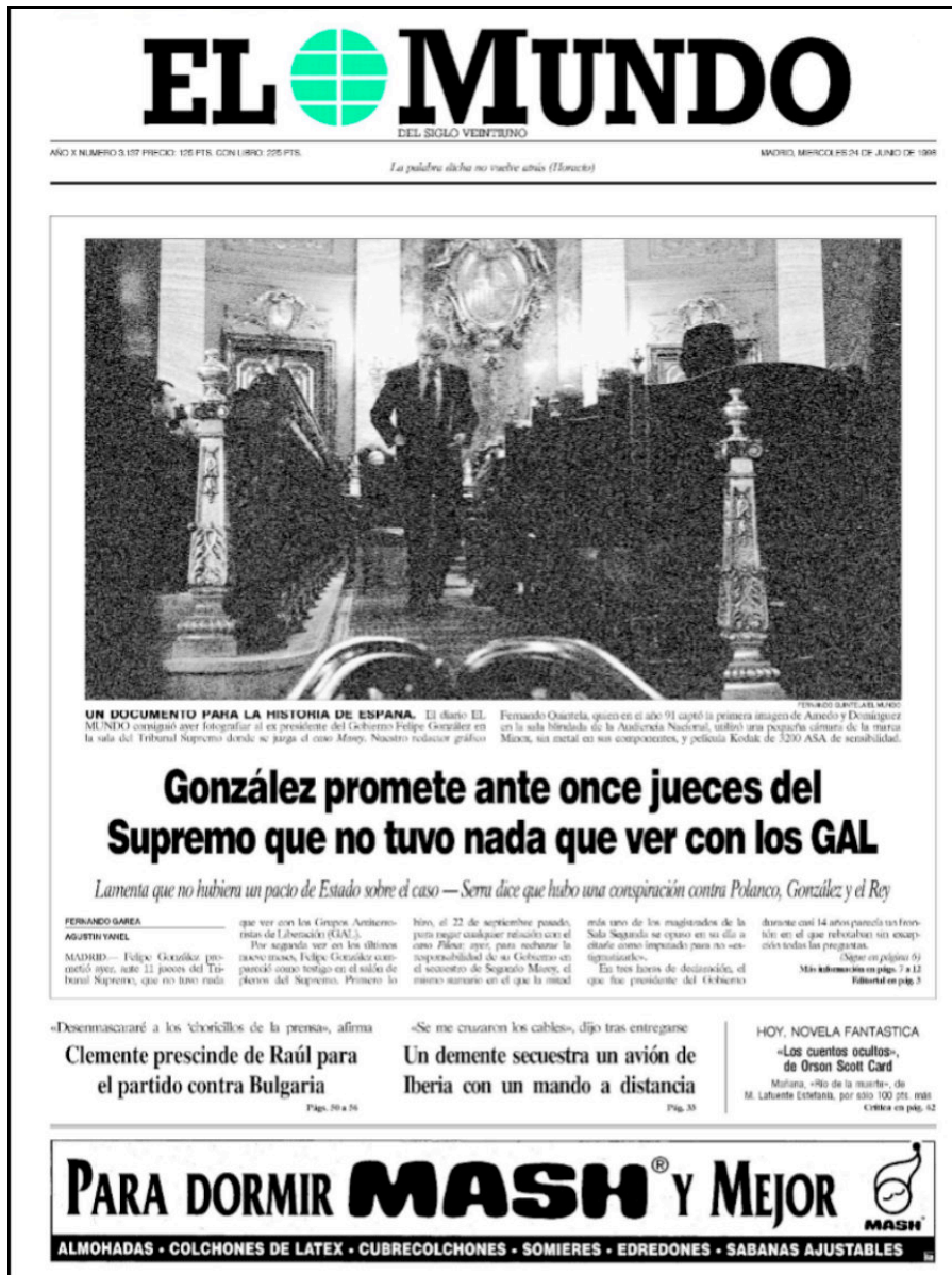
Figure 1.- Former Spain's PM Felipe González at the Supreme Court, photographed by undercover journalist Fernando Quintela ( El Mundo , 24 June 1998)

Image retrieved 15 November 2018 from https://www.elmundo.es/album/television/2017/05/10/59120c18e5fdea1a718b4590_13.html